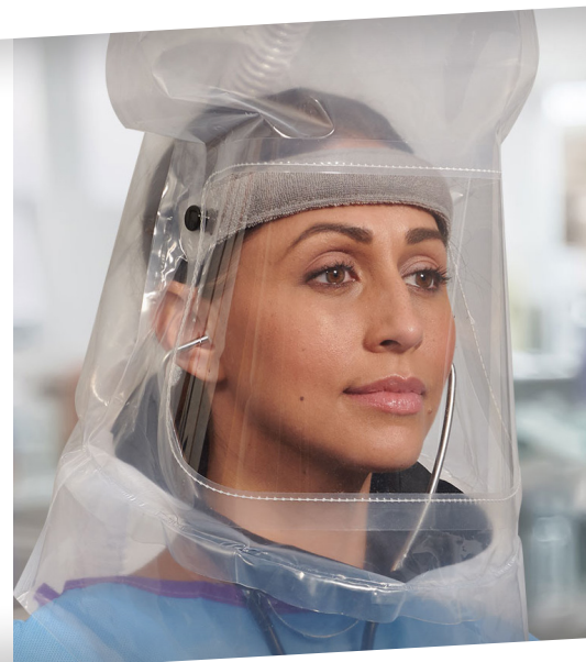
EZ-03, EZ-25 EZ BioHood