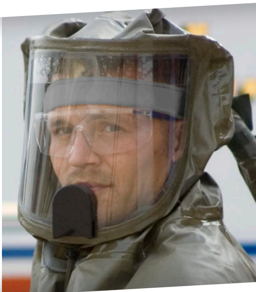
S-2001 Butyl Hood Assembly includes Beathing Tube